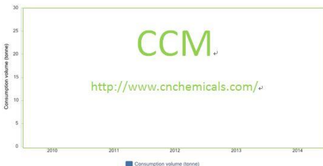
Figure 2.4.1-1 Consumption of mogroside V in China, 2010-2014