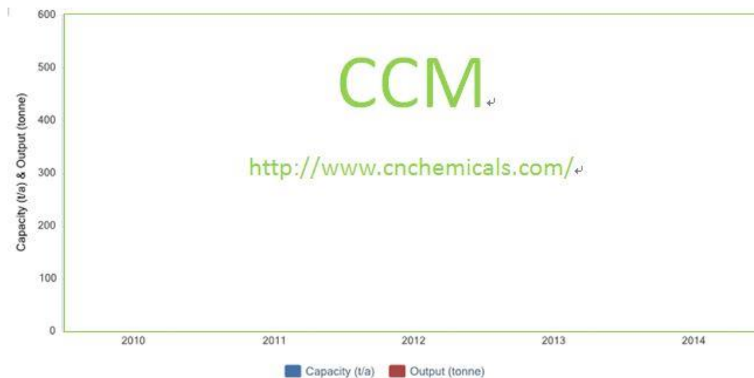
Figure 2.1.1-1 Capacity and output of mogroside V in China, 2010-2014